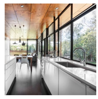
Architect: Refresh* Design